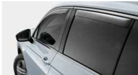
Side Window Deflectors — Tinted