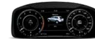
Driver profile selection