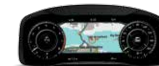
Wide map navigation view

The Tiguan can store up to four driver profiles, remembering your personalization preferences for a wide variety of different settings and systems.