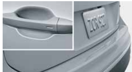
Rear Bumper and Door Cup Paint Protection Film