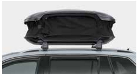
Base Carrier Bars and URBAN LOADER®**